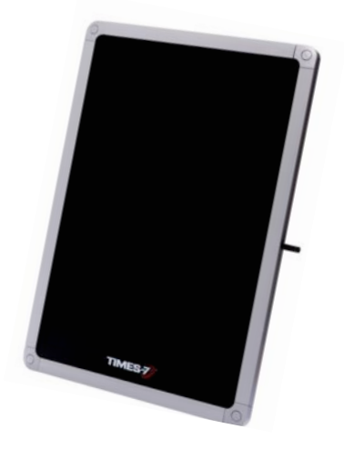
The SlimLine A6032